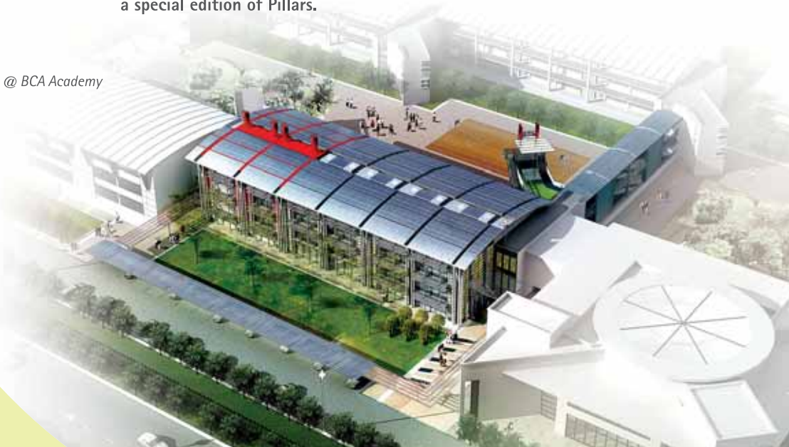
Zero Energy Building @ BCA Academy